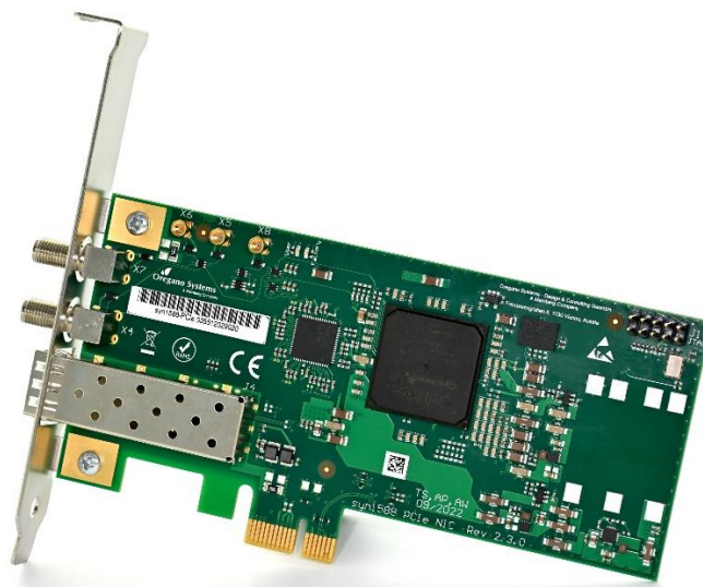
syn1588 ® PCIe NIC Revision 2.3

The syn1588 ® PCIe NIC is a standard 100/1000 Mbit PCI Express Ethernet network interface card with enhancements to provide highly accurate clock synchronization via the IEEE1588 standard. The syn1588 ® PCIe NIC provides all real-time functions required for an IEEE1588 node to operate both in master and slave mode.