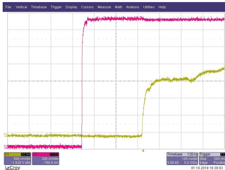
figure 1. 1 PPS measurement

The following figure shows an example of such a measurement.