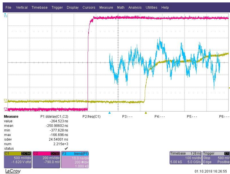
figure 2. 1PPS measurement with statistics